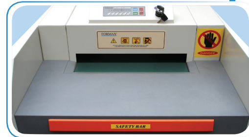
Large infeed deck with conveyor belt feeder and safety bar for immediate shut down

Keeping the 8804 Series in top condition is easy to do. With the Auto Cleaning function, clearing the blades of shredding debris is as simple as pressing Reverse on the control panel. Plus, the EvenFlow™ Automatic Oiling System lubricates the all-steel cutting blades, helping to keep the shredder in peak condition for optimal efficiency.