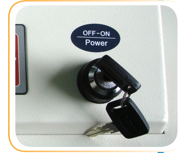
Keyed On/Off switch

The 8804 Series offers unmatched automated features through its LED control panel. The easy-to-read Load Indicator assists operators in determining how close they are to the maximum shred capacity to avoid jams and provide optimal efficiency. Indicators also notify operators when the waste bin is full or the cabinet door is open. Operators can select from two modes of operation: Auto Start/Stop or Manual. Auto Start/Stop mode utilizes optical sensors which detect paper and start/stop operation automatically. Manual mode provides non-stop operation for shredding small sized paper or films.