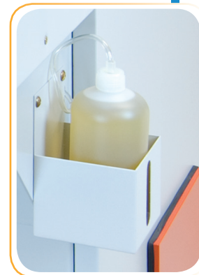
EvenFlow™ Oiling System Reservoir Bottle

Safety is an important component in the 8804 Series design and engineering. A large 18"-wide safety bar is located in front of the conveyor belt system and will shut down the shredder instantly when pressed. A safety key and lock system is also included to ensure the shredder is operated only by authorized staff.