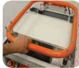
Ergonomic by design, the tubular seal arm delivers dependable, long-term service.