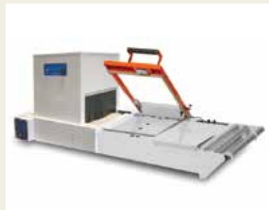
Clamco Combo Junior shrink wrap system