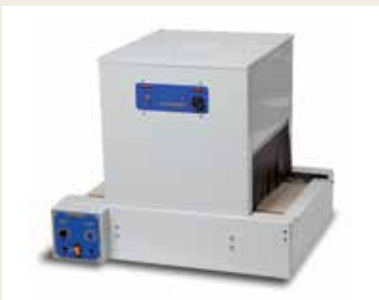
Clamco 820 shrink tunnel

Our family of Clamco tabletop sealers and shrink tunnels are the perfect solution for dependable, long-life performance. Designed for smaller production demands, these products are constructed of heavy-gauge materials and combine advanced engineering with rugged, time-proven features. Each is expertly crafted by Clamco, the industry's respected name for reliability and value.