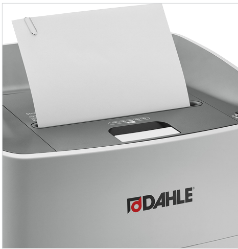
Use the manual feed for quick shredding of a few sheets at a time.

Quickly and easily shred up to 14 sheets in the manual feed opening or stack up to 300 sheets in the auto-feed tray.