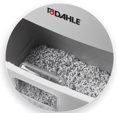
Security Level P-4 for the destruction of confidential documents.