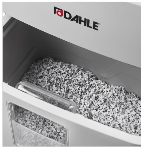
Easy-to-empty waste bin features a clear window for viewing shred level.