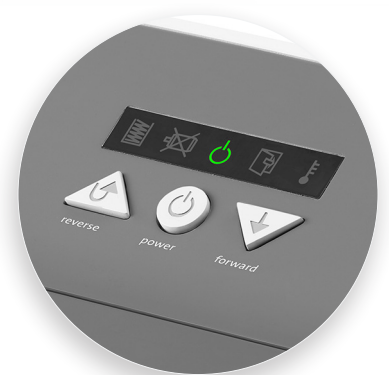
Convenient, easy-to-use controls for simple operation.