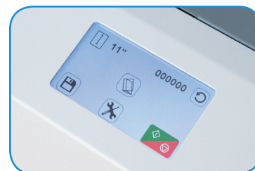
Touchscreen control panel is graphics-based making it easy to use