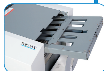
Automatically adjusting fold plates make for quick and easy setup