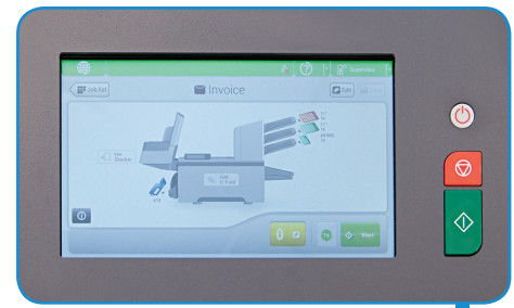
Full-color 7" touchscreen control panel with graphical interface and paper /envelope presence sensors

* Paper & envelope specifications may vary. All media must be tested.