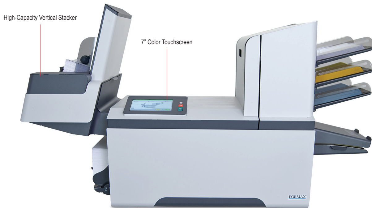
FD 6306-Standard 3 with High-Capacity Vertical Output Stacker