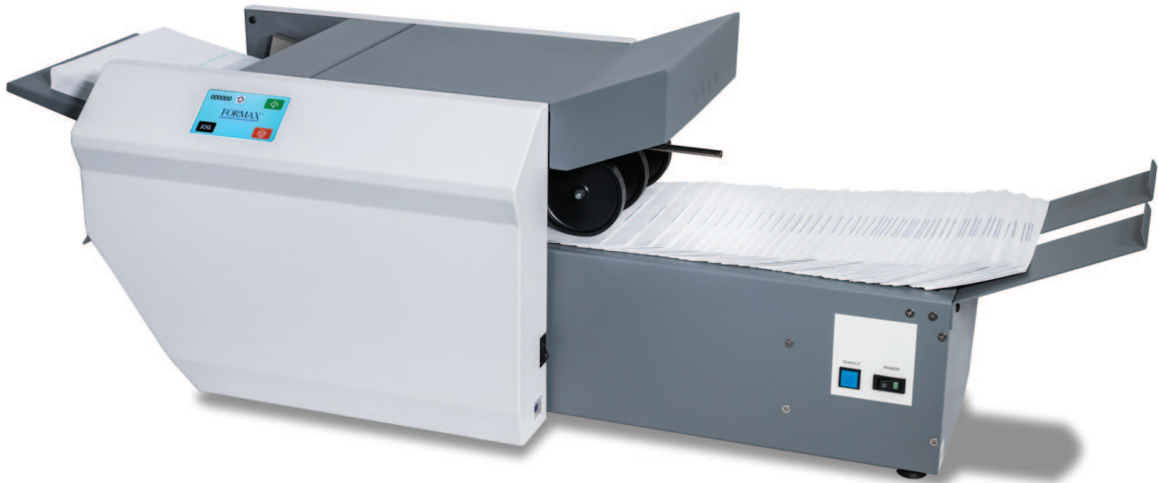
FD 2006 shown with optional conveyor

MyBinding.com 5500 NE Moore Court Hillsboro, OR 97124 Toll Free: 1-800-944-4573 Local: 503-640-5920