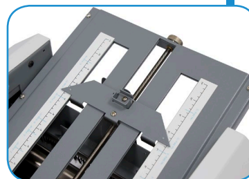
Clearly marked fold plates are easy to adjust