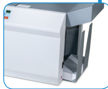
Standard Catch Tray