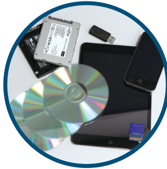
Multimedia Devices: Easily shreds a variety of media from mobile phones to mini tablets