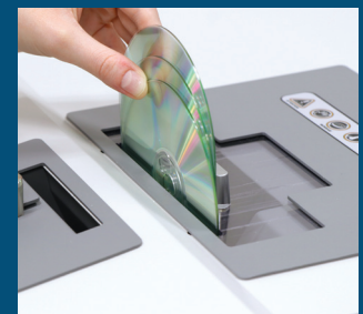
CDs and DVDs