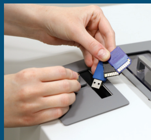
USBs and SD Cards