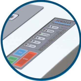
User-Friendly Control Panel: ECO Mode, Door Open Sensor, Reverse, Bin Full Indicator

The Formax FD 87SSD OnSite Multimedia Office Shredder is designed for the modern technological world. It easily shreds mobile phones, SSDs, mini tablets, USBs, and more. The FD 87SSD is whisper-quiet and operates on standard 120V power , making it ideal for the office environment. It features a user-friendly LED control panel , a sturdy all-metal cabinet on casters , solid steel cutting blades , and a rugged chain-driven motor . The separate enclosed infeed options allow users to safely shred a variety of media up to 6.5" wide. With its commercial-grade construction and features, the FD 87SSD sets the standard for safety and security.