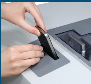
Mobile Phones and SSDs