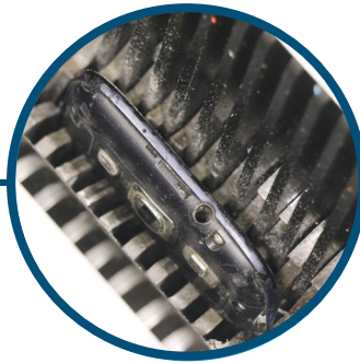
Commercial Grade: Solid-steel heat-treated blades and rugged chain-driven motor