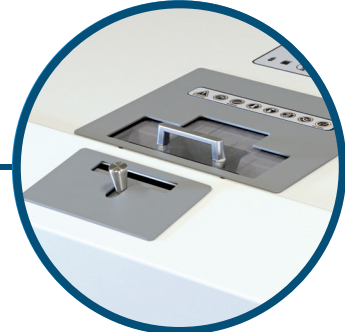
3 Dedicated Infeed Options: Safely feed various size media through the appropriate infeed, up to 6.5" W