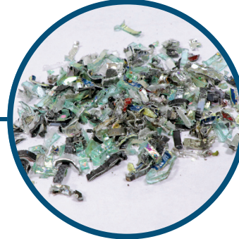
Media Shredding: Shreds media into random pieces up to 0.60". Perfect for security and peace of mind