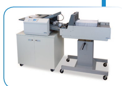
FD 2054 in-line with optional V-Stack36 Vertical Stacker, stand and cabinet

MyBinding.com 5500 NE Moore Court Hillsboro, OR 97124 Toll Free: 1-800-944-4573 Local: 503-640-5920