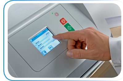
User-friendly color touchscreen control panel

The FD 6102 can process a variety of documents up to 14" in length, including checks, invoices, newsletters and business reply envelopes. Two sheet feeders and one insert/BRE feeder allow for a number of jobs to be automatically processed including: 1 sheet, 1 sheet and a BRE, 2 sheets, or 2 sheets and a BRE. The FD 6102 has multiple feed stations which allow you to make your single sheet mailings "work for you" by using the second feeder to insert a direct marketing piece.