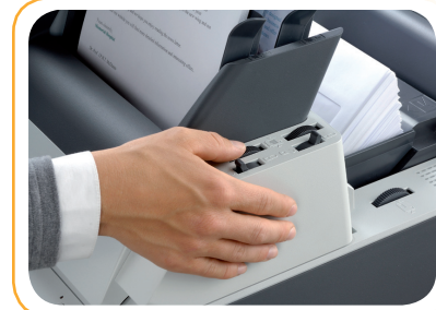
Easy to load feeders

The FD 6102 folds and inserts at speeds up to 1,360 pieces per hour and can hold up to 100 sheets/inserts in each feeder. The semi-automatic mode folds up to five stapled or unstapled sheets of 20# paper in one motion. The document feeder swap mode maximizes output by filling both sheet feeders with the same documents. When the first feeder empties, the second automatically starts feeding without interruption. This feature allows for a total sheet feeder capacity of up to 200 sheets.