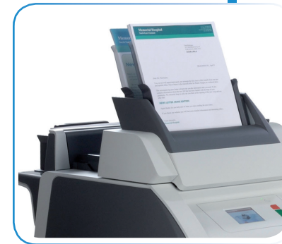
2 Sheet feeders and 1 insert/BRE feeder

Automation saves time, money and reduces the amount of handling, making the document more secure. To ensure the integrity of mailings, the FD 6102 has true double document detection which prevents double feeding. This electromechanical system is not sensitive to paper dust or colored paper, ensuring the right document goes to the correct recipient.