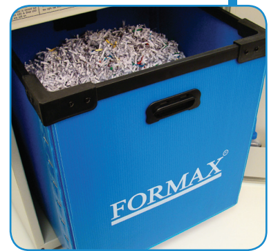
Lifetime Guaranteed Heavy-Duty Waste Bin