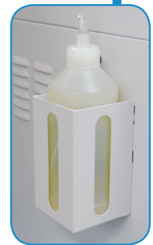
Optional EvenFlow™ Automatic Oiling System

MyBinding.com 5500 NE Moore Court Hillsboro, OR 97124 Toll Free: 1-800-944-4573 Local: 503-640-5920