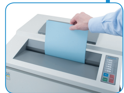
Standard Infeed accommodates up to 24 sheets at once

MyBinding.com 5500 NE Moore Court Hillsboro, OR 97124 Toll Free: 1-800-944-4573 Local: 503-640-5920