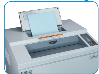
Dedicated AutoFeeder holds up to 175 sheets