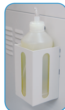
EvenFlow™ Automatic Internal Oiling System

*Capacity varies depending on paper and power supply