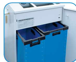
Separate Waste Bins for Paper and Optical Media