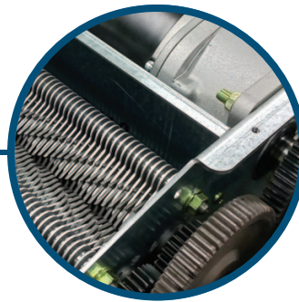
Commercial Grade: Heat-treated solid steel cutting blades, all metal gears, and a powerful AC geared motor