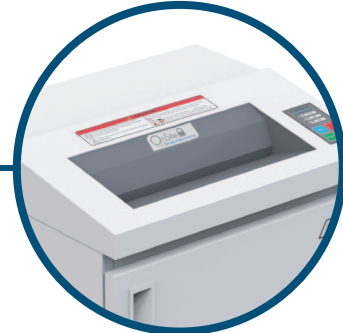
10.5" Feed Opening: Handles sheets up to 10.5" wide, up to 7 sheets at a time