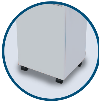
Rugged All-Metal Cabinet: Includes casters for mobility