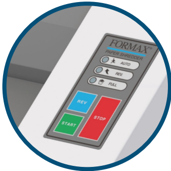
User-friendly Control Panel: Auto, Reverse, Bin Full Indicator, Start and Stop

The FD 8304CC Deskside Shredder combines space-saving design with commercial-grade components including an all-metal cabinet , heat-treated steel blades , heavy-duty AC geared motor , and rugged lifetime guaranteed waste bin . It features a user-friendly LED Control Panel , and has the power to shred staples and paper clips . This compact, rugged model easily provides on-site destruction of sensitive information for small businesses or the home office.