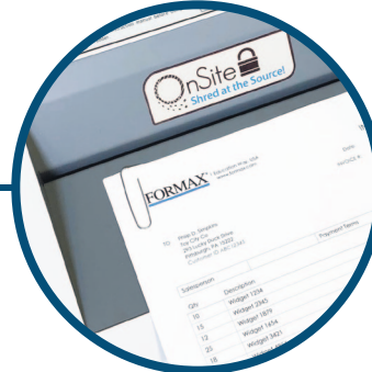
Accepts Staples & Paper Clips: Durable steel cutting blades handle staples and paper clips with ease