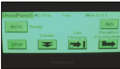
LCD touch screen interface