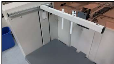
Feeder with capacity up to 250mm (5 reams ~ 2 500 sheets)