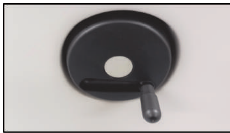
Easy format set-up with simple hand wheel activating all side lay gauges