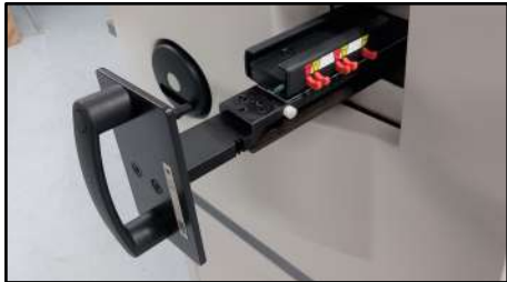
Easy tool change in less than 2 minutes