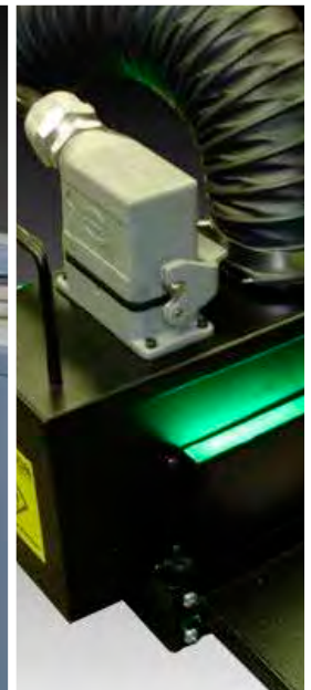
DESIGN & ENGINEERING

TEC Lighting is the world leader in the design, manufacture, and distribution of UV lamps, curing equipment, and special energy sources. We have over 100 years of combined experience in UV curing technology. Our flexible approach to engineering, problem solving and development of processes make us an ideal partner for your curing applications.