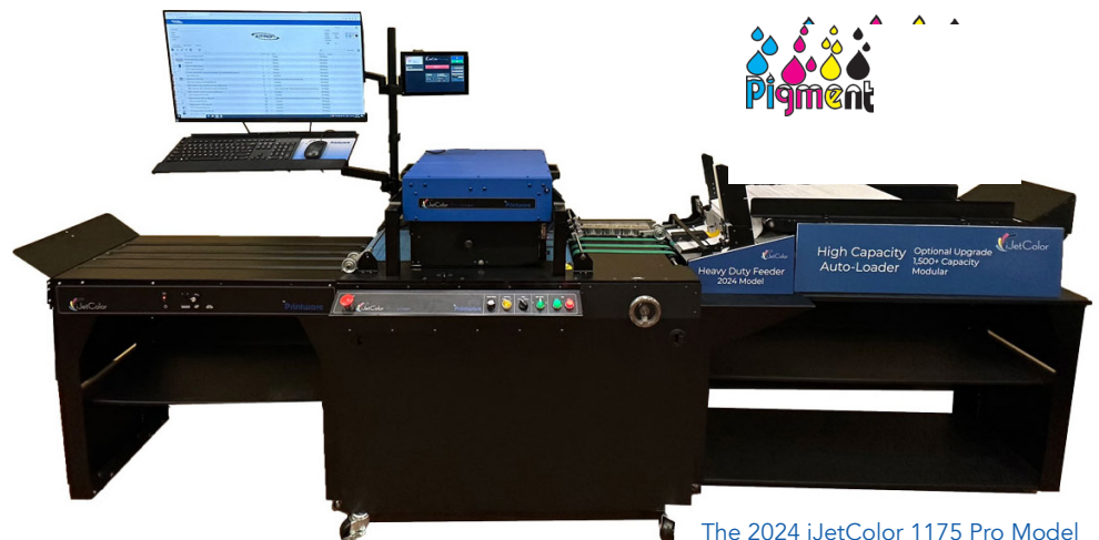
The 2024 iJetColor 1175 Pro Model shown with High-Capacity Auto-Loader

Each unit can be backed by affordable comprehensive 5-year service program all guaranteed by a dedicated, focused manufacturing team from Printware.